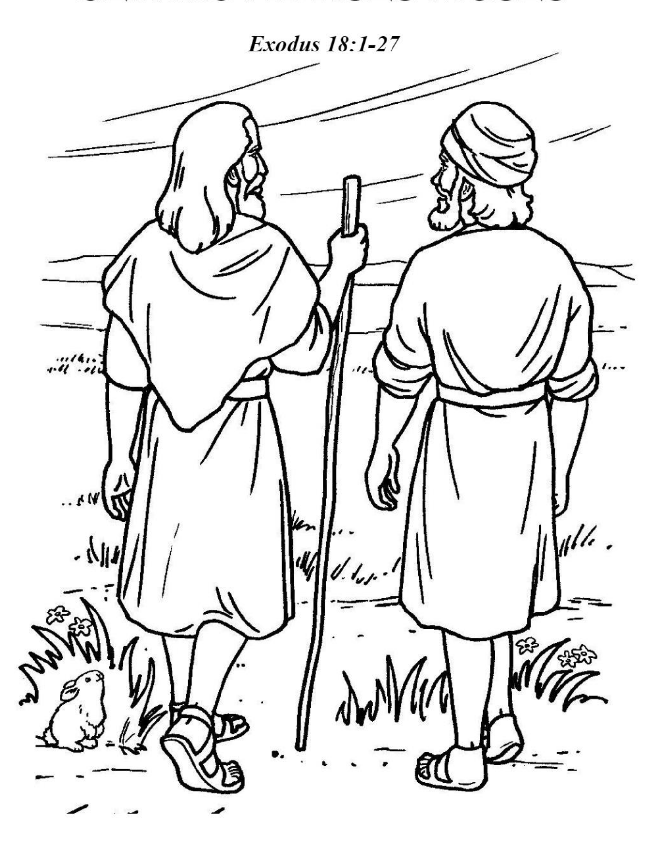
Jethro tells Moses that he should choose judges to help out